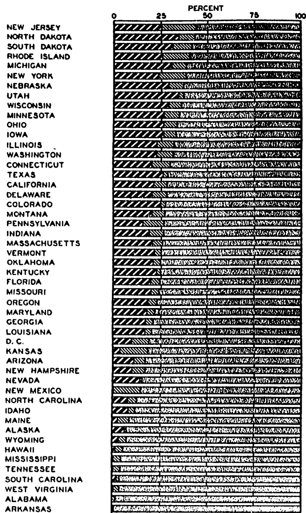
Chart III.—Old-age assistance: Recipients who were living in households receiving simultaneously another grant of old-age assistance, some other type of assistance, or no other assistance, accepted during the fiscal year 1937-38, in each State with a plan approved by the Social Security Board

ANOTHER GRANT OF OLD-AGE ASSISTANCE ANOTHER TYPE OF ASSISTANCE NO OTHER ASSISTANCE