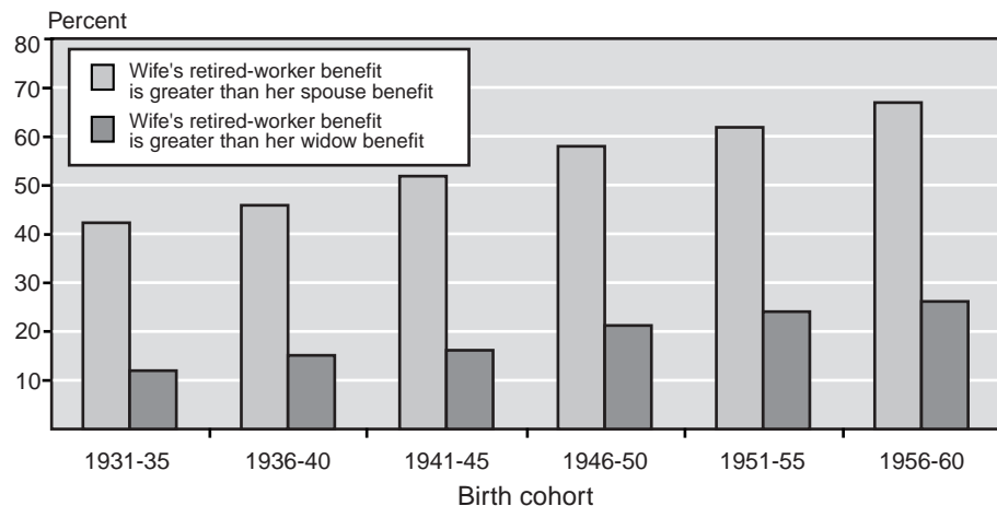
Chart 2.—Projected percentage of married women who will receive only retired-worker benefits at retirement, by birth cohort

Source: Authors' calculations using MINT data.