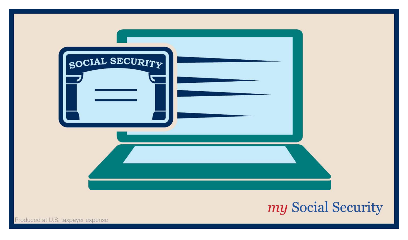
Figure 1 – Request a replacement Social Security Card